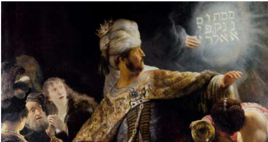
Rembrandt (1606-1609)