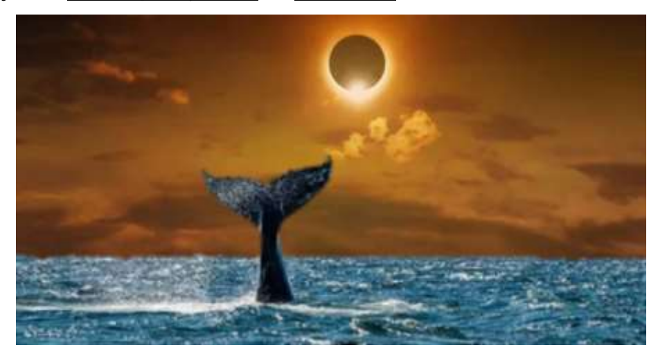
"But He answered and said to them, 'An evil and adulterous generation seeks after a sign, and no sign will be given to it except the sign of the prophet Jonah." Matthew 12:39

Posted by LynL to 444 Prophecy News on 2024/03/18